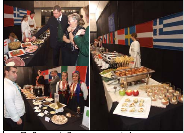
The European buffet - a cornucopia of culinary surprises

The cultural part of the event, held in front of a large audience in addition to the other participants, also lived up to its promises: there was a succession of sketches, singing and dancing, with the usual last-minute improvisations, laughter and thunderous applause. It all took place in an informal atmosphere, just for the pleasure of showing yet again the diversity of European customs relating to Christmastide.