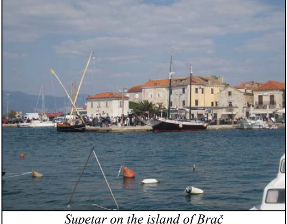
Supetar on the island of Brač

The competition included 366 competitors from 56 schools (197 competitors from 25 AEHT member schools from 6 countries - Austria, Finland, Macedonia, Portugal, Slovenia and Croatia).