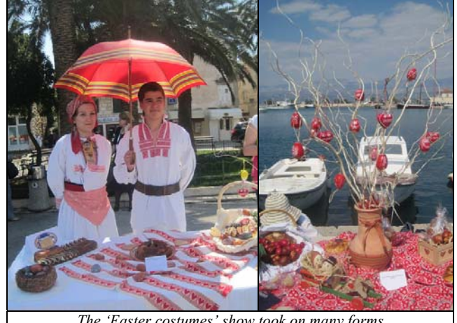
The 'Easter costumes' show took on many forms

The participants were very pleased with the organisation, the accommodation as well as the competitions and activities that took place during the event. The next edition is already in preparation. Roll up as soon as the registration period starts!