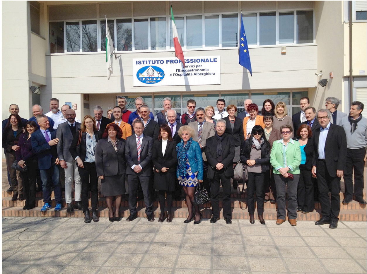
The Members of the Executive Board together with the chief judges and the organising team of the 28 th AEHT Annual Conference gathered on the steps of the I.P.S.E.O.A. in Cervia