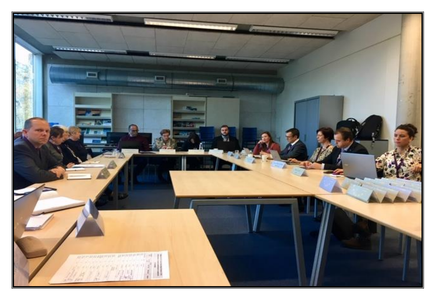
MEMBERS OF THE EXECUTIVE BOARD AT THEIR MEETING AT FRIESLAND COLLEGE IN LEEUWARDEN (NL)