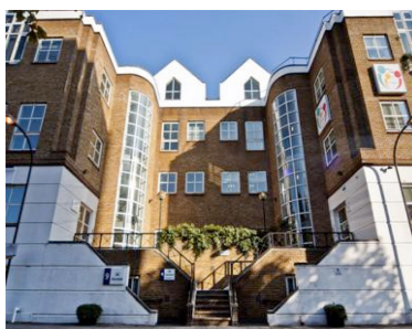
Docklands Academy, London