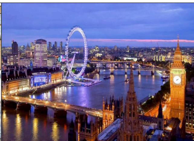
Docklands Academy, London

The AEHT Youth Parliament will be organized as follows: