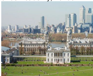
Greenwich maritime museum